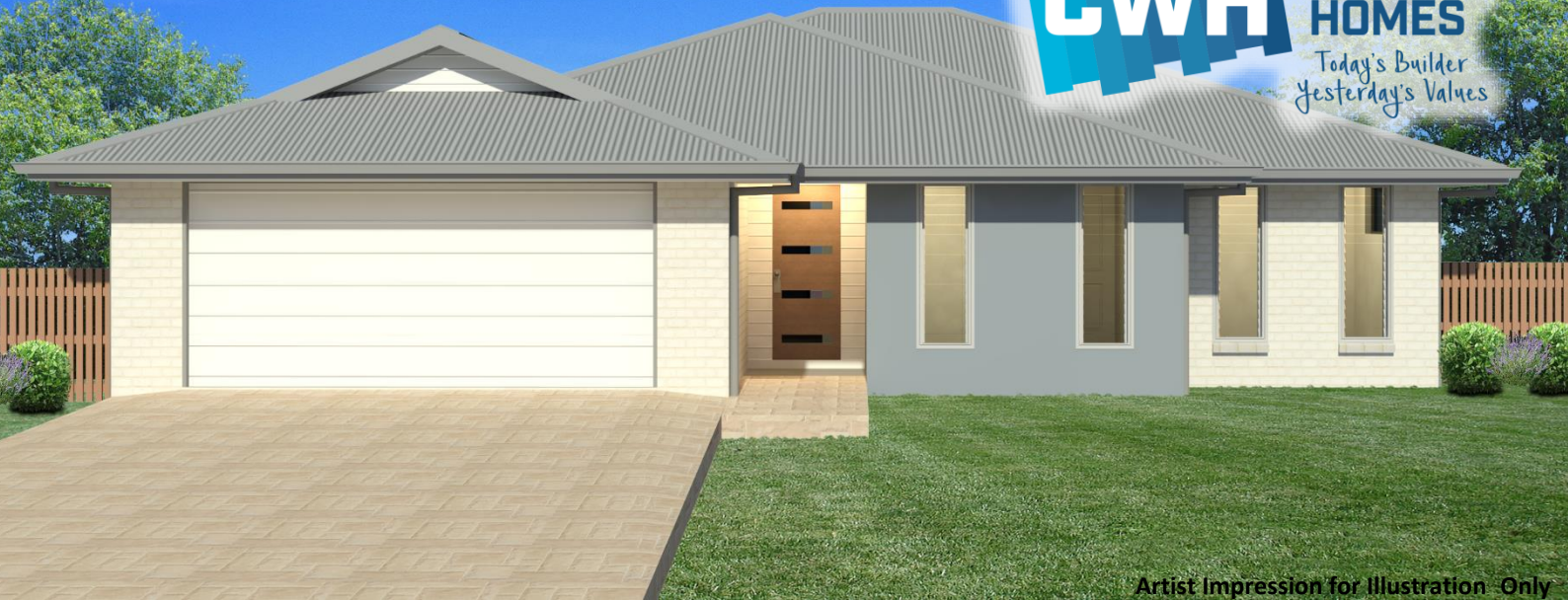
Artist Impression for Illustration Only

CHRIS WARREN HOMES Today's Builder Yesterday's Values